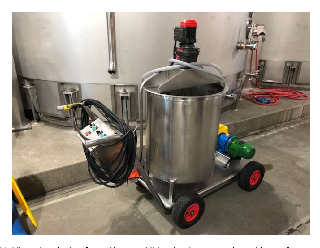
Mobile tank and mixer for making up additives in winery, complete with transfer pump.