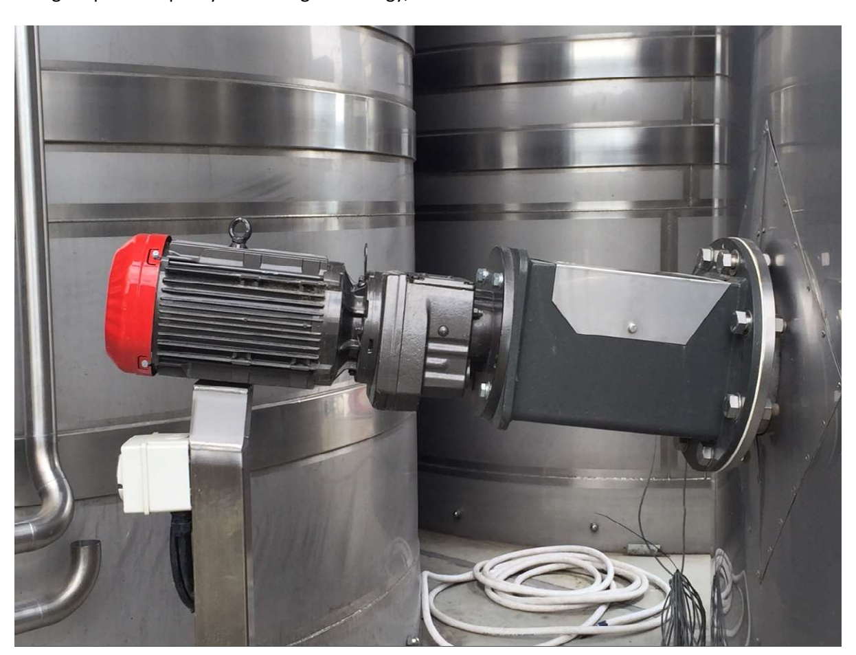
Large Side Entry Agitator in 340m<sup>3</sup> Wine Silo, model M5000 which has the facility to service the drive and/or the mechanical seal without emptying the contents of the silo.

By using a mixer correctly designed for the application and the tank it is to be used in the quality of the mixing/agitation/blending and subsequent downstream processes will be improved and can lead to higher product quality and savings on energy, time and manual labour.